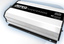
EPEQ® INVERTER3000 48V, 120VAC, 3kW