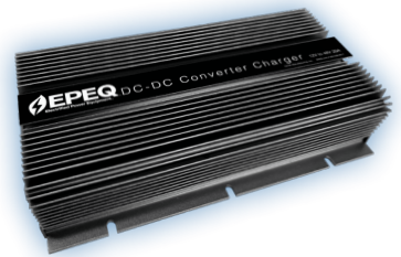
EPEQ® DC-DC CONVERTER 12V to 48V, 20A

12V input to 48V output to charge the ELiMENT™ Battery, available in both 20A output. Recharges the battery back while driving.