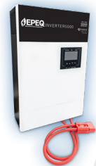
EPEQ® INVERTER5000 48V, 240VAC, 5kW (stackable)