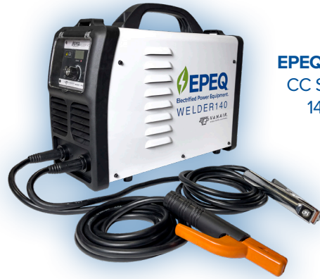
EPEQ® WELDER140 CC Stick Welding, 140A Option

The Vanair® EPEQ® 140A Welder combines the flexibility of lithium-powered welding with Vanair's long history of providing top-level welding capabilities. The ability to carry the entire welder and cables (34 lbs. total weight) right next to the equipment being worked on, makes the EPEQ® Welder extremely user-friendly for those fast repair jobs.