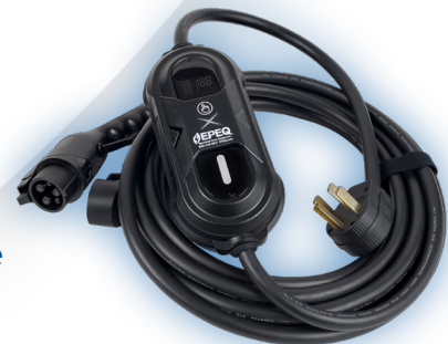
Level 2 Charging Available

The level 2, EPEQ® EV Charger is your gateway to unparalleled convenience and flexibility for electric vehicle charging. Whether you're at home, at work, or on the move, this charger is designed to elevate your charging abilities. Engineered with a NEMA 14-50P plug, our portable charger boasts high compatibility, ensuring it's the perfect fit for a wide array of electric vehicles and plug-in hybrids adhering to the J1772 standard. The charger's dual-purpose design and extra-long, 25' cable is also rated IP66 waterproof and dustproof, and is built to withstand extreme temperatures.