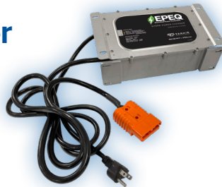
Shore Power 120VAC