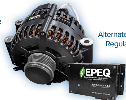
Alternator and Regulator

The EPEQ® Alternator and Regulator is the perfect addition to charge your ELiMENT™ Battery under hood within 1-2 hours. By adding the EPEQ® alternator, your EPEQ® system stays charged with no user interaction. The EPEQ® Alternator and Regulator communicates with the EPEQ® System Smart Controller and automatically adjusts power output based on needs. This ensures long battery life, safe operation, and optimal performance.