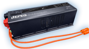
EPEQ® INVERTER6000 48V, 120VAC/240VAC, 6kW Low Frequency

The EPEQ® 48V AC Power Inverter lineup includes four Pure Sine Wave inverters to fit any need. The EPEQ® INVERTER3000 provides both a high frequency 120V or a low frequency 120VAC/240VAC, while the high frequency INVERTER5000 provides 240VAC. Both inverters communicate with the EPEQ® System Smart Controller for simple, efficient use, and installation. The uniqueness of the EPEQ® 5kW inverter is that it is stackable to achieve 10kW, 240VAC power. The low frequency EPEQ® INVERTER6000 provides 120VAC/240VAC power with 300% surge output.