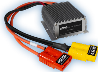
EPEQ® DC-DC CONVERTER 48V to 12V, 60A

Provides power when the vehicle is off for emergency lighting.