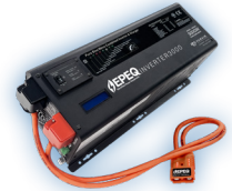
EPEQ® INVERTER3000 48V, 120VAC/240VAC, 3kW Low Frequency